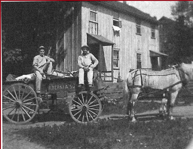
Hibernia Store Wagon