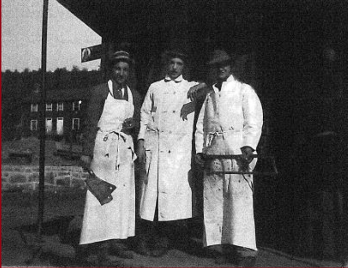
General Store butchers